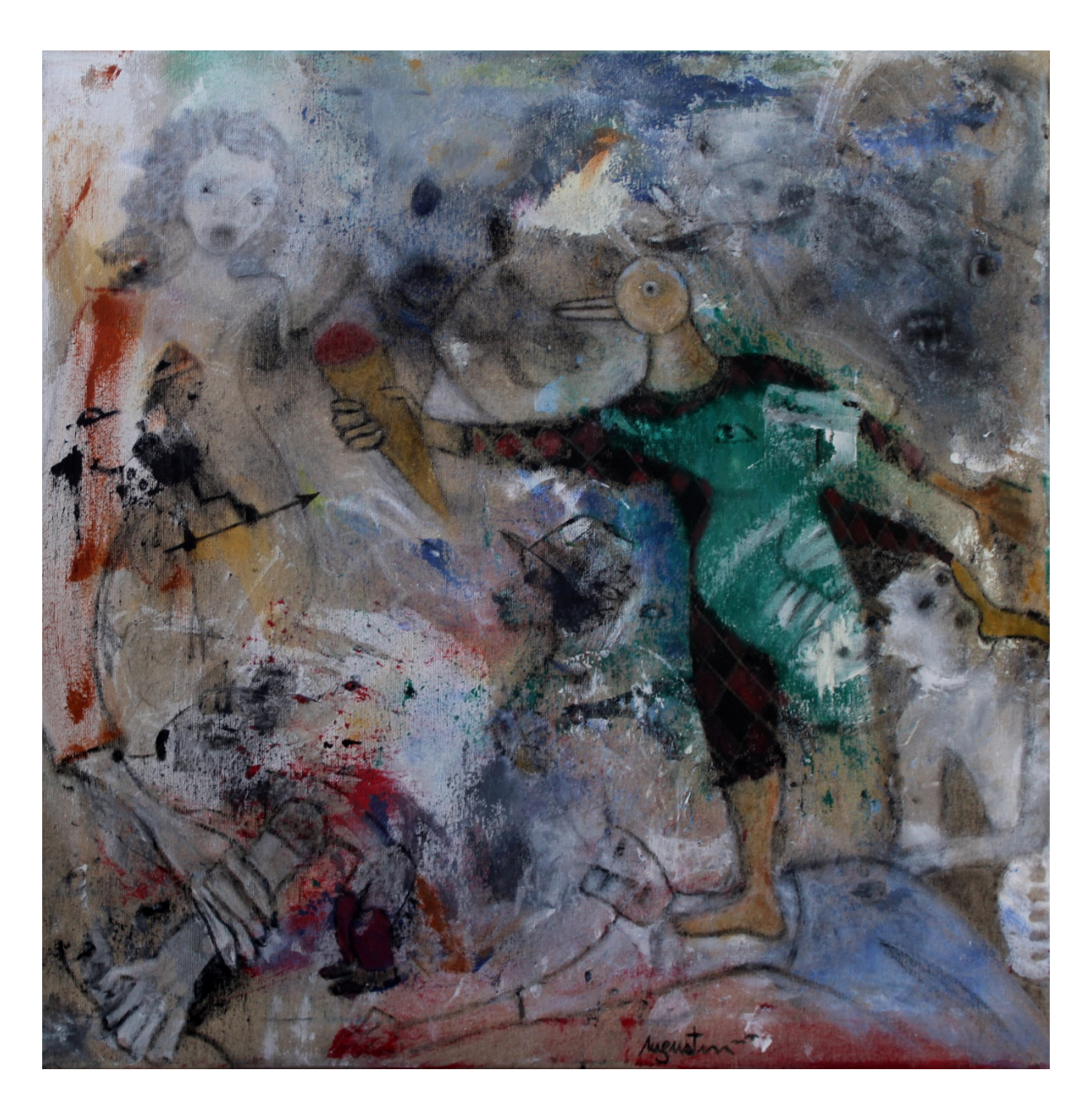
NEVERMIND THE NAME #6 Acrylic on canvas, 70x70 cm, 7.9.2019

Main inspiration for this painting came from an old French book called "120 days of Sodom", by Marquis de Sade.