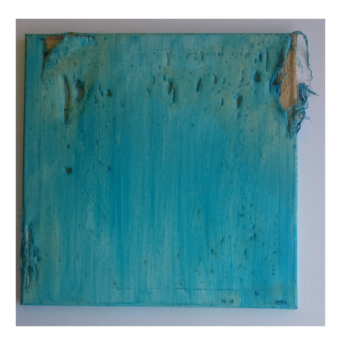
SCRATCH OF CREATION No. 3 Oil on Canvas, 40x40 cm, 2017

The calming blue, just like the sky above us. It is the most beautiful on a warm sunny day, without a cloud in sight, but not all days can be perfect. No matter what we do, how we live our lives, dreary things will happen to each and every one of us. The only thing we can control, is how we react to events that have fallen upon us.