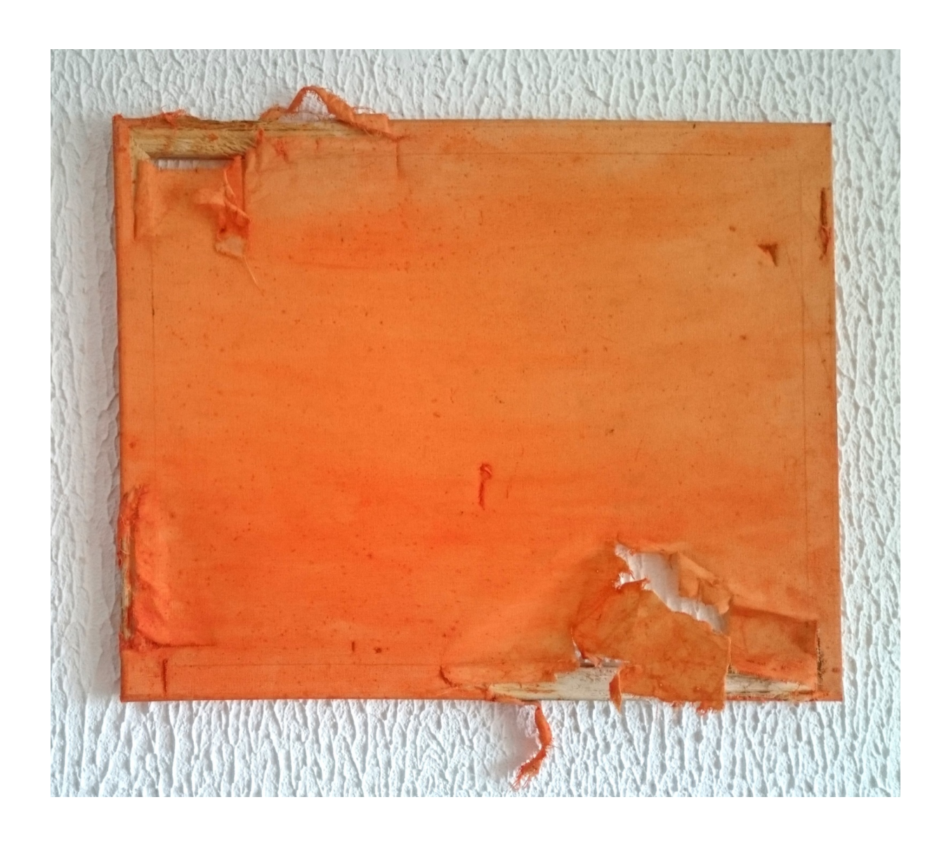
SCRATCH OF CREATION No.5 Oil on canvas, 50x40 cm, 2017

It was the year 2016. I sit in my atelier and I think and think. Unexcitingly I hear a scratching noise, somewhere near me. I look down on the floor and I see a blank canvas that has fallen to the ground. On it stands my black cat. The scratching noise came from her. I look at more closely, to see what is she doing. Right away I notice a tear in the canvas.